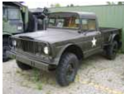
Russell Military Museum - This 1968 M-715 Kaiser Jeep can be yours for $6,000