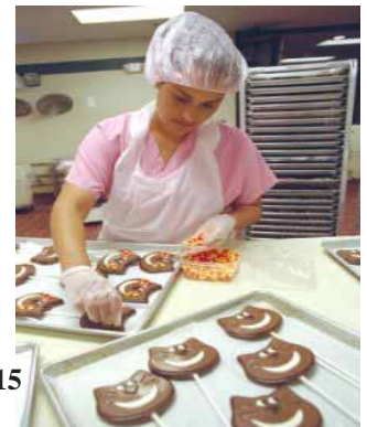
Long Grove Chocolate Factory