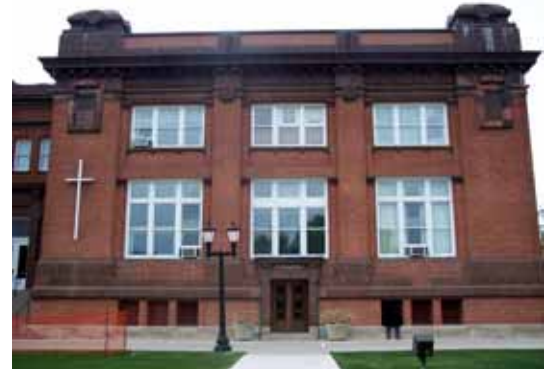
Bldg. #4 Blue Jacket Memorial Chapel