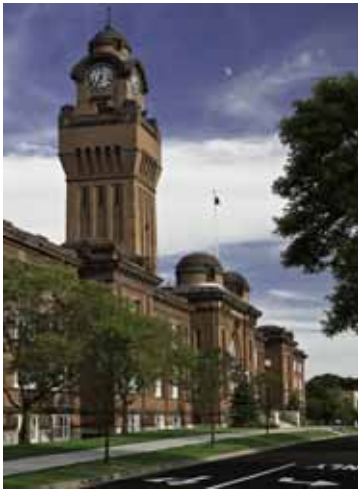
Bldg. #1 Central Admin. Bldg