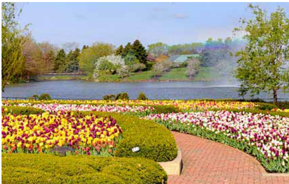
Chicago Botanical Garden