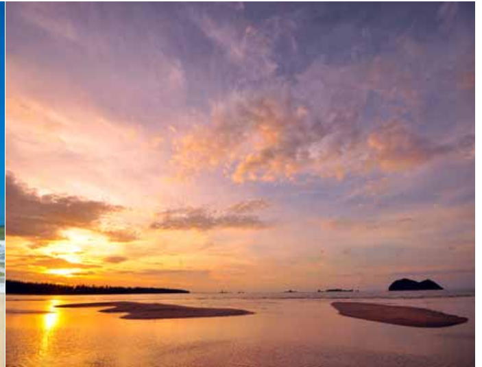
These girls just heard the great news that the USS Knapp crew was coming to Myrtle Beach, SC, so don't disappoint them. MAKE YOUR RESERVATION NOW! The other photo shows the sunrise you will enjoy every morning at the Sand Dunes Resort.